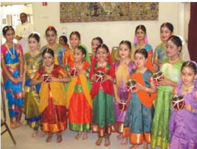
Arudra Natyanjali Dance Program