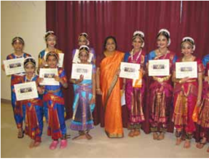
Arudra Natyanjali Dance Program