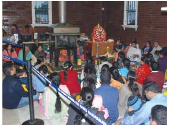
Maha Ganpati Homam on New Year