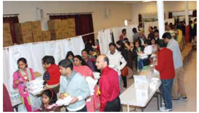
New Year Day Devotees