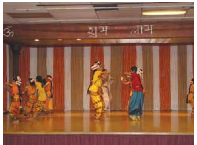
Arudra Natyanjali Dance Program