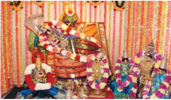
New year Day Alamkaram - Maha Vishnu