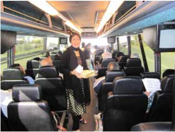
Seniors Bus Trip