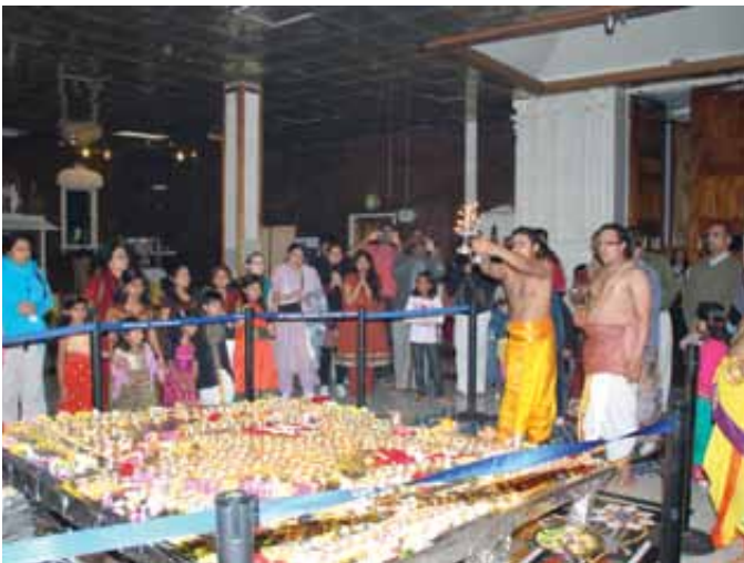
Maha Shiva Rathri - Jyothirlinga Archana