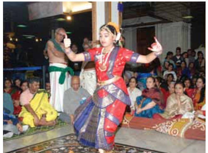
Maha Shiva Rathri - Nrithya Seva