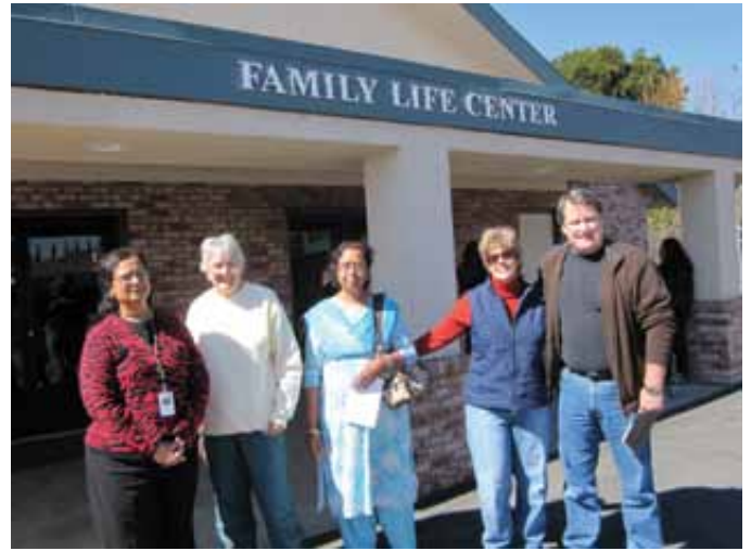
Seniors Bus Trip