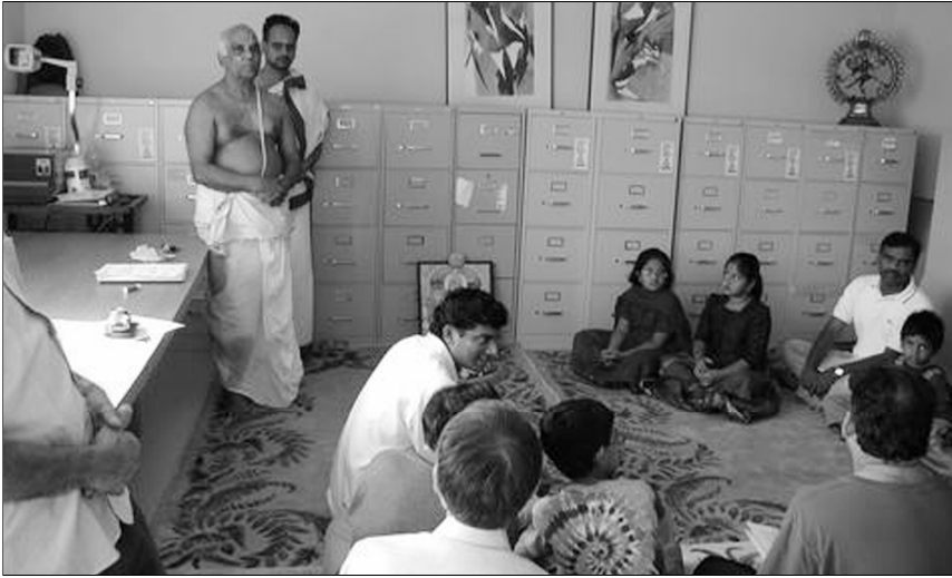
Picture from Balajyothi classes

Education is the basis of knowledge. Learning about one's cultural roots and heritage forms one's identity. One such program about learning about culture and its emphasis on our well being is the Balajyothi program offered by the Youth and Education committee. This program is focused on children ages 3 and up, and their parents. We have students aged 3 to 40!