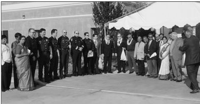
Invitees outside the Assembly Hall

At this event, the HCCC had also invited the local police and fire departments to participate and donated $1000 each to the Livermore Police Officers Association and the Livermore-Pleasanton Fire Department