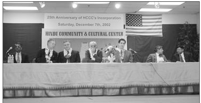
Function in the Assembly Hall