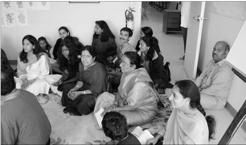
Reading hour at Y&E Library