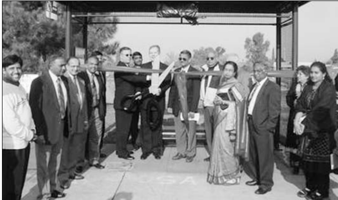
Opening of bus shelter by Mayor

The 25th anniversary of HCCC's incorporation was celebrated on Saturday, December 7th 2002. On this occasion, two other significant programs were also held that day, a Bus Shelter donation program and a Donor Recognition program.