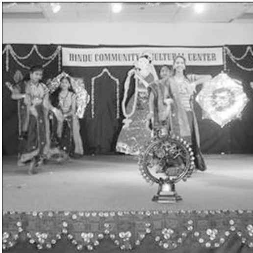
Performances by Youth during the program

Thank you "FUNDRAISING TEAM 2002". Some pictures from the event are shown in this page.