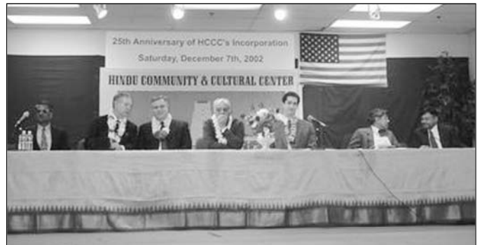
Function in the Assembly Hall