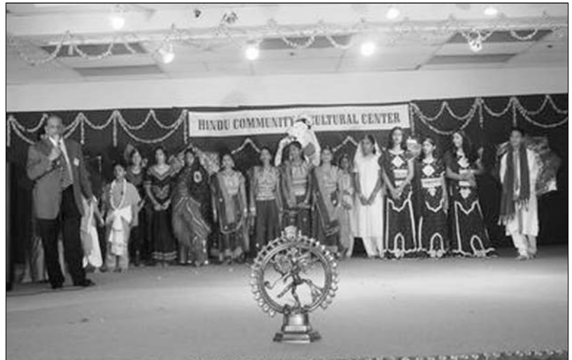
Performers as a group