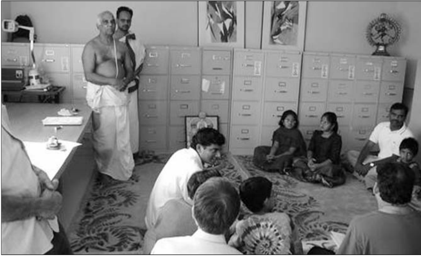
Picture from Balajyothi classes

Education is the basis of knowledge. Learning about one's cultural roots and heritage forms one's identity. One such program about learning about culture and its emphasis on our well being is the Balajyothi program offered by the Youth and Education committee. This program is focused on children ages 3 and up, and their parents. We have students aged 3 to 40!