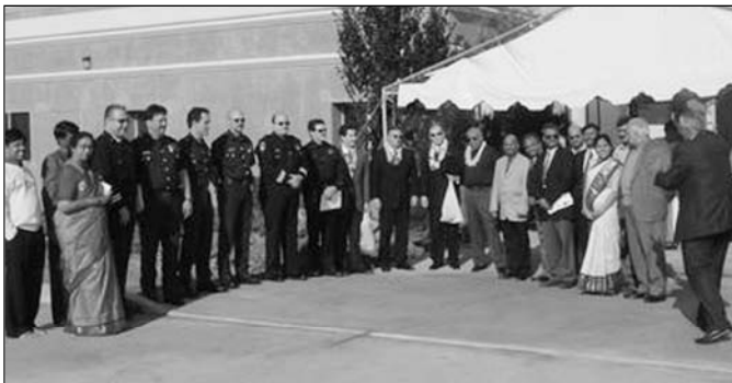
Invitees outside the Assembly Hall

At this event, the HCCC had also invited the local police and fire departments to participate and donated $1000 each to the Livermore Police Officers Association and the Livermore-Pleasanton Fire Department