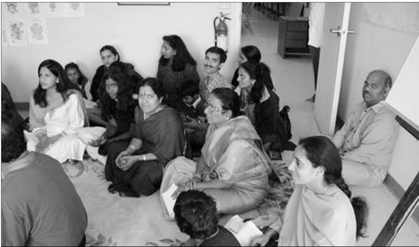
Reading hour at Y&E Library