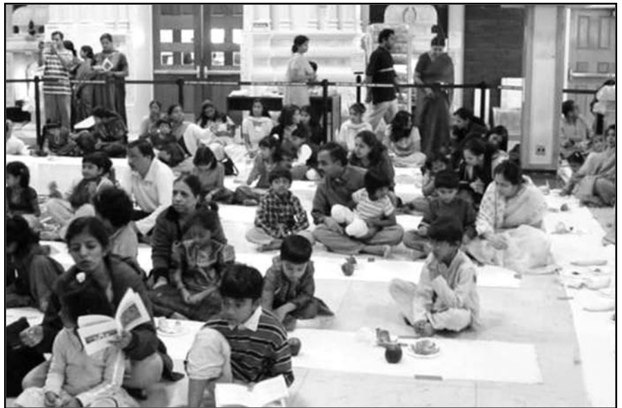
Children performing Samoohika Ganesha Puja