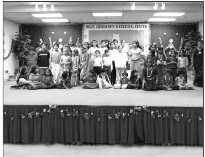
Cultural program participants

We hope to continue this trend and make this an annual event. Comments/Suggestions on this program are welcome and should be sent to vrvenkat@sbcglobal.net .