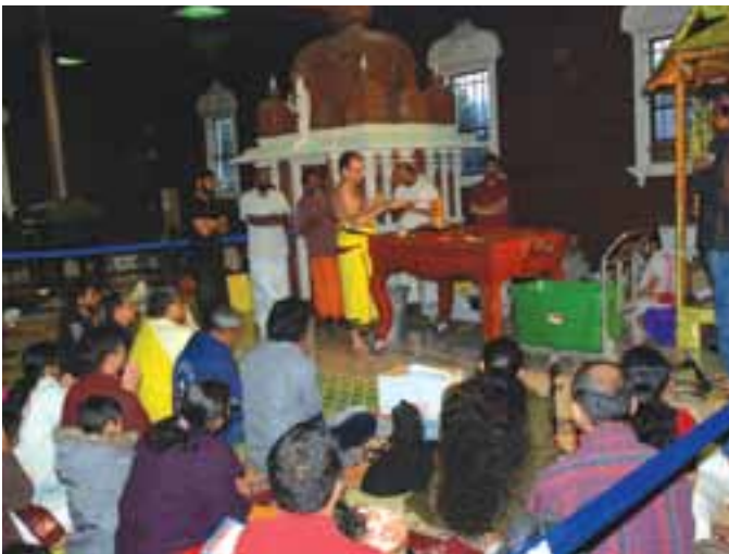
Makara Vilakku Puja