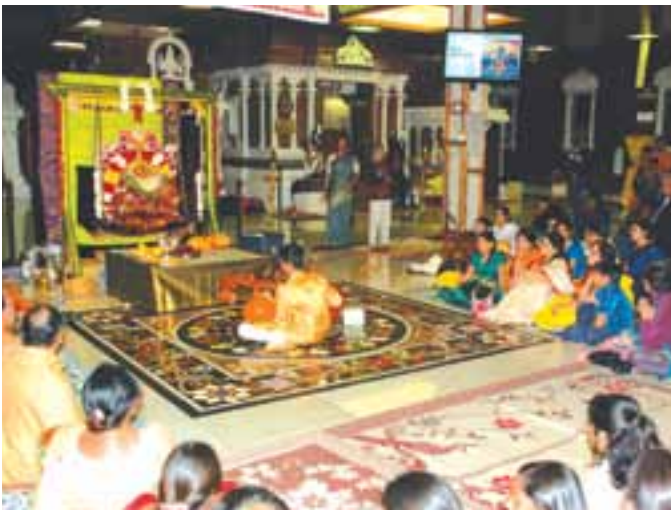
Goddess Saraswati Utsava Murthi Samprokshana