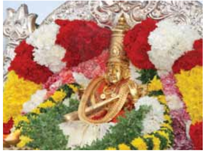
Goddess Saraswati Utsava Murthi Samprokshana