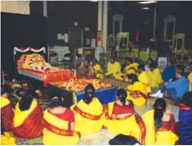
Goddess Saraswati Utsava Murthi Samprokshana