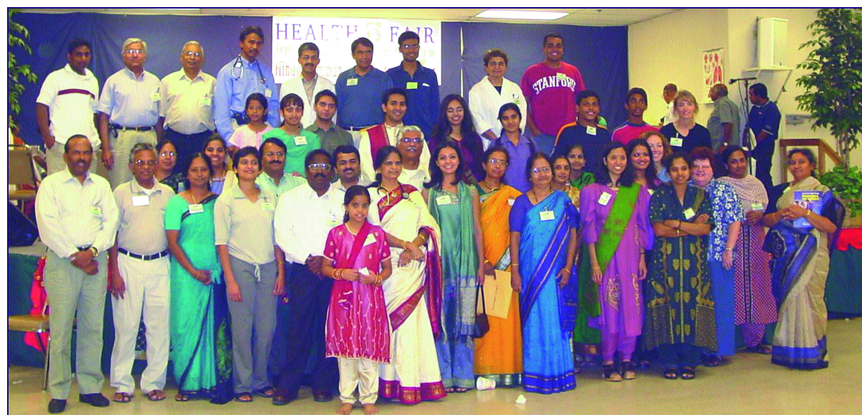
Some of the volunteering physicians, medical professionals and other volunteers participated in the Health Fair