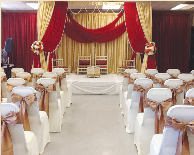
Badrinath Event Hall (left and immediately below)