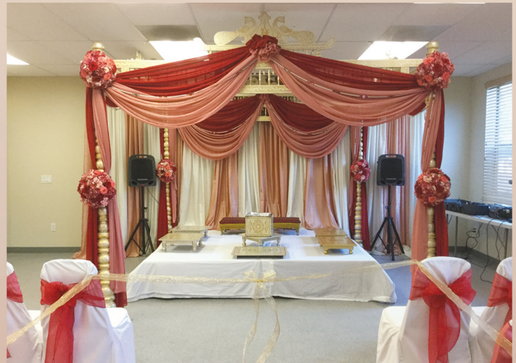
Kedarnath Event Hall (immediate right and below)

Badrinath Event Hall (seats 140 in lecture and 112 in banquet style) has a Homa Kunda and is ideal for small to medium-sized weddings. The hall is equipped with a nice portable audio system. The Hall can be configured as two small halls (as the East and West Halls) for smaller weddings. The Homa Kunda is located in the east side. Often, wedding parties have found it convenient to conduct weddings here and set up dining facilities in the adjacent Kedarnath Event Hall. They have also found it useful to rent the Yamunotri and Sabarimala dressing rooms.